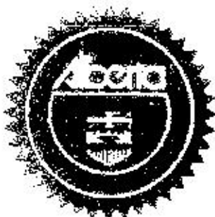
Registrar of Corporations

CANADIAN OLD TIMERS RODEO ASSOCIATION CHANGED ITS NAME CANADIAN SENIOR PRO RODEO ASSOCIATION. THE NEW NAME WAS REGISTERED ON JANUARY 21, 1994